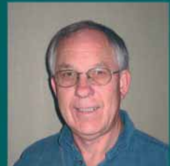
Russell Dale Future Forests Research

"Jon Dey will present an overview of capital utilisation comparing forest industry operations in New Zealand with leading countries in the market."